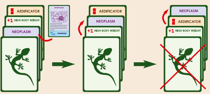
TURN 2. Food bank development phase

Player B has played NEOPLASM on a Player A's animal with the traits HIGH BODY WEIGHT and AEDIFICATOR.